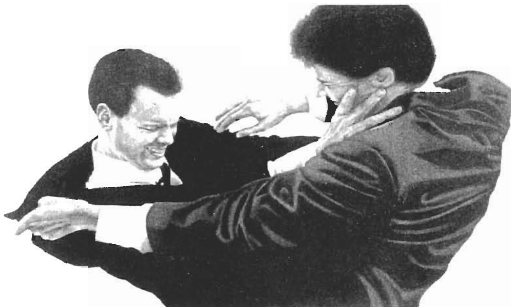
Robert Longo, Untitled Work on Paper, 1981. (Two yuppies contesting the last double latte at a restaurant?)

purely in our heads. How many hippos worry about whether Social Security is going to last as long as they will, or what they are going to say on a first date? Viewed from the perspective of the evolution of the animal kingdom, sustained psychological stress is a recent invention, mostly limited to humans and other social primates. We can experience wildly strong emotions (provoking our bodies into an accompanying uproar) linked to mere thoughts.* Two people can sit facing each other, doing nothing more physically strenuous than moving little pieces of wood now and then, yet this can be an emotionally taxing event: chess grand masters, during their tournaments, can place metabolic demands on their bodies that begin to approach those of athletes during the peak of a competitive event.† Or a person can do nothing more exciting than sign a piece of paper: if she has just signed the order to fire a hated rival after months of plotting and maneuvering, her physiological responses might be shockingly similar to those of a