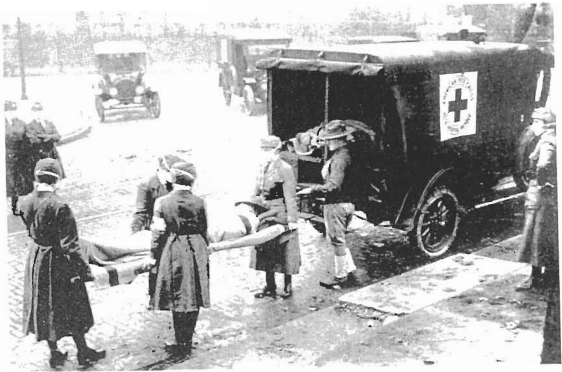
Influenza pandemic, 1918.

Of course not. Our nights are not filled with worries about scarlet fever, malaria, or bubonic plague. Cholera doesn't run rampant through our communities; river blindness, black water fever, and elephantiasis are third world exotica. Few female readers will die in childbirth, and even fewer of those reading this page are likely to be malnourished.